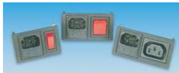
Single Pole Switched H=39.1, W=62.7 Cut out: H=34.4, W=60.3 Double Pole Switched H=39.1, W=74.5 Cut out: H=34.4, W=72.0 Fused Inlet/Outlet H=39.1, W=79.5 Cut out: H=34.4, W=76.5