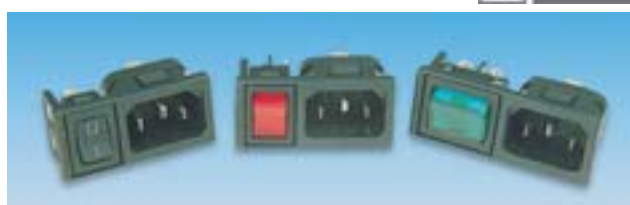
Single Pole, Non illuminated H=24, W=48.5 Cut-out: H=21.3, W=45.9 Single Pole, illuminated H=24, W=48.5 Cut out: H=21.3, W=45.9 Double Pole, illuminated H=24, W=57.5 Cut out: H=21.3, W=54.9